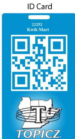
(QR Code linked to customer used for authentication)